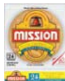
Mission 16 oz (24 count) yellow corn extra thin tortillas