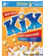
Plain flavor only

Cold cereal: less than 12 oz. Hot cereal: less than 11.8 oz.