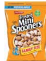
Plain flavor only*