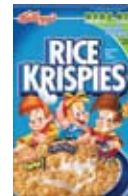
Plain flavor only