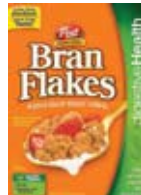
Plain flavor only*