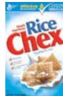
Plain flavor only