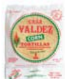
Casa Valdez 12 oz soft corn tortillas