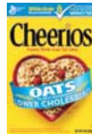
Plain flavor only*