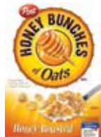
Honey Roasted only*