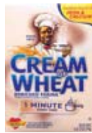
Plain flavor only