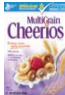
Plain flavor only*