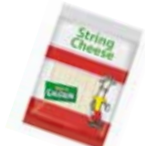
Mozzarella String Cheese (16 oz multi-stick bag of mozzarella only)