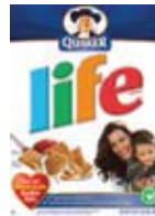
Plain flavor only*